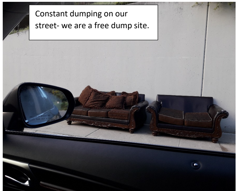
Constant dumping on our street- we are a free dump site.